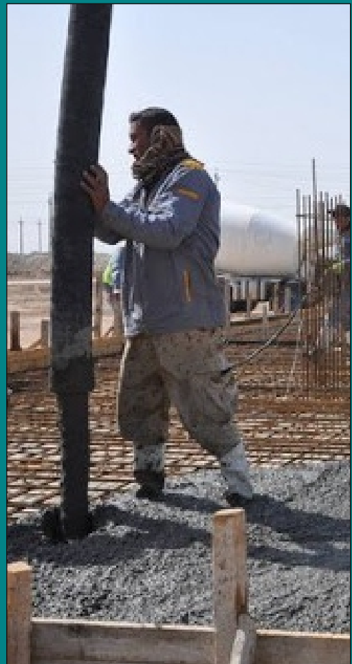
Sewage lifting Vehicles