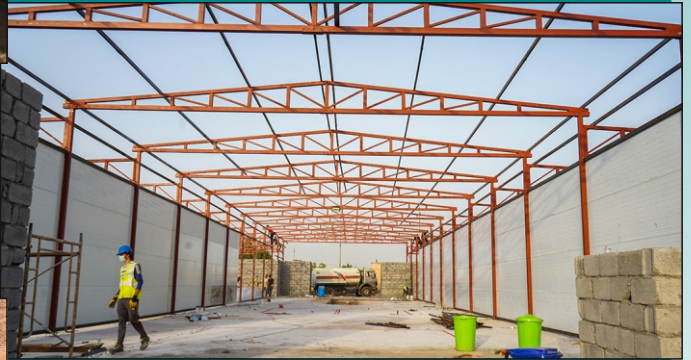
Build ware Houses