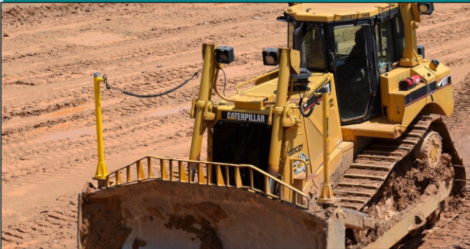
Preparing Land for construction