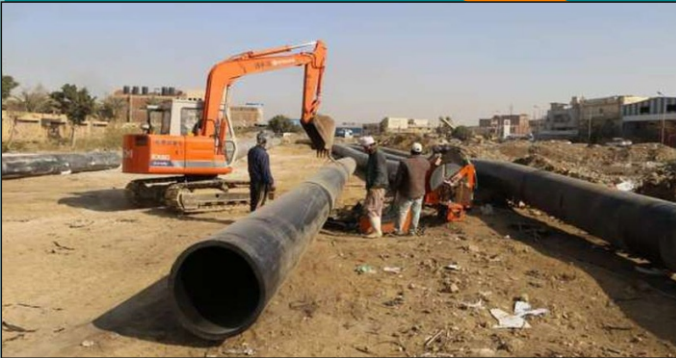
Water and Swage Systems